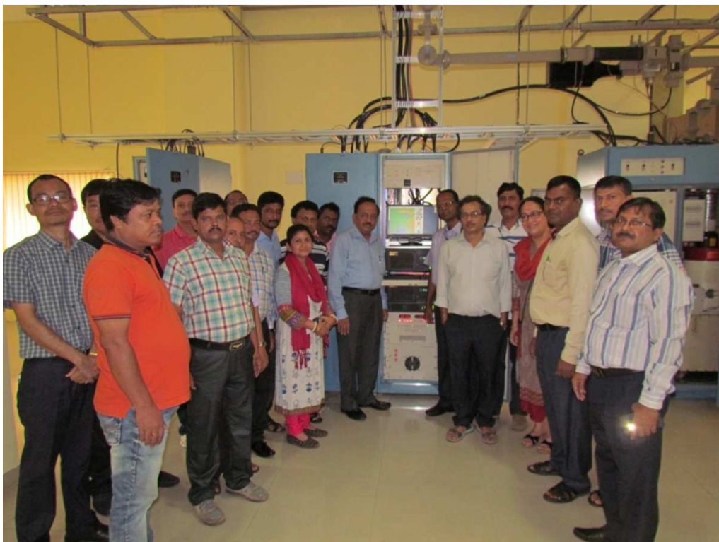
Hon'ble Minister Dr. Harsh Vardhan in the equipment room of DWR Agartala