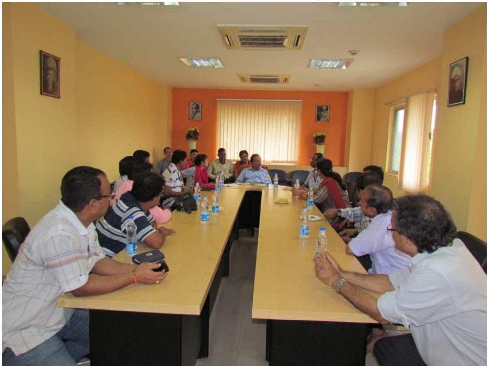
Hon'ble Minister Dr. Harsh Vardhan addressing officers and members of staff of MC Agartala